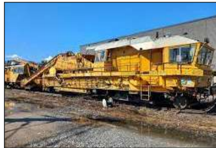
Ballast Cleaning & Regulating Machines