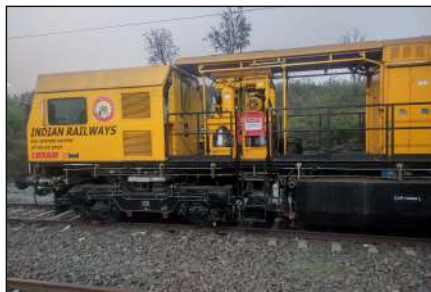
Rail Grinding Machines