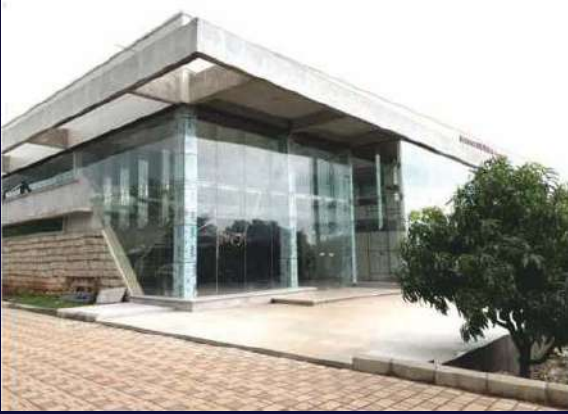
SERVOCONTROLS facility Industrial Estate, Udyambag, Belagavi

SERVOCONTROLS 100% EOU Unit in 12 acres of land near Hattargi Belagavi SEZ