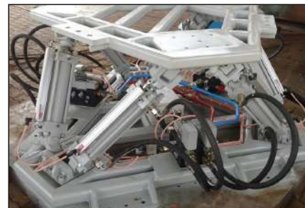
Simulation & Testing Platforms