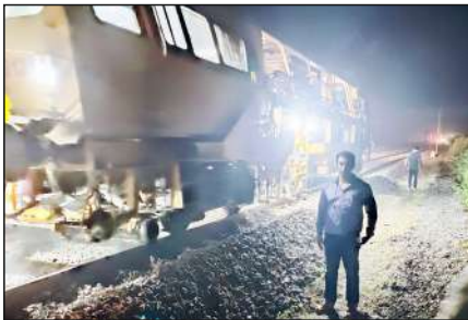
Track Lining & Leveling Machines