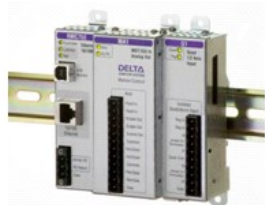
Delta RMC70 Motion Controller